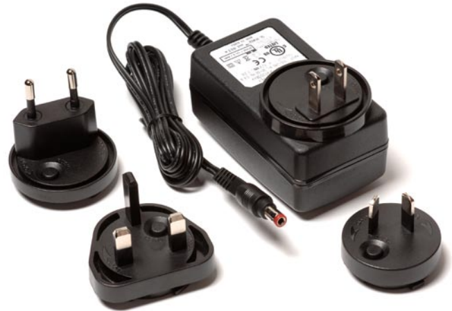
*Photo shows optional blades kit