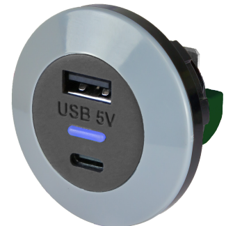
PRPWp-ACFf, front fitting version can be screwed in place from the front, then covered with the attractive ring to avoid tampering.