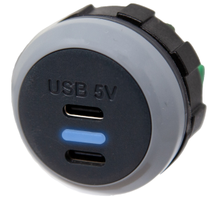
PRPWp-CC, standard fit CC USB charger secured into place with locking nut.

The PRPWp range of chargers are manufactured using rugged components to provide years of service in demanding commercial environments and are covered by a three year return to base guarantee.