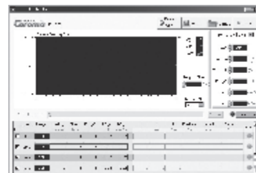
Battery Discharge Test