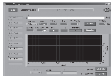
User Defined Waveform

All specifications are subject to change without notice.