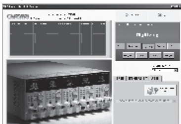
Main Operation Menu